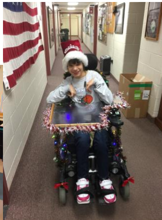
Holiday celebrations begin

Welcome to SMS: "Caring, Cooperative and Respectful Community of Learners"