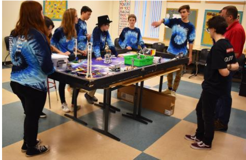
Robotics Team State Winners